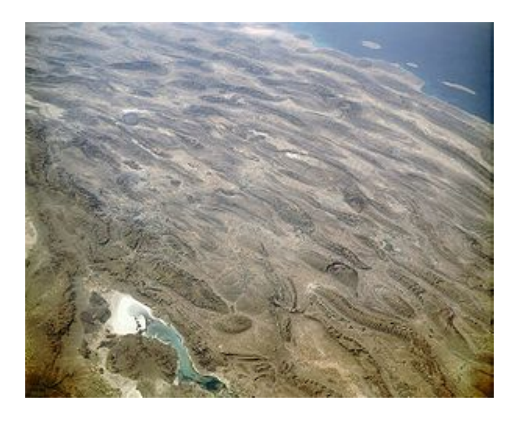
Fault-block Mountains – Wasatch Mountains, Utah