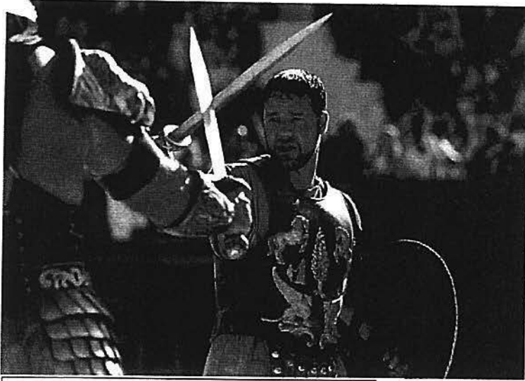
Russell Crowe, image from Gladiator , 2000.