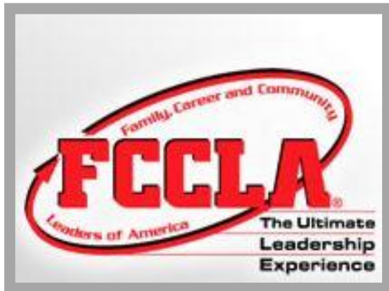
FCCLA Logo and Tagline