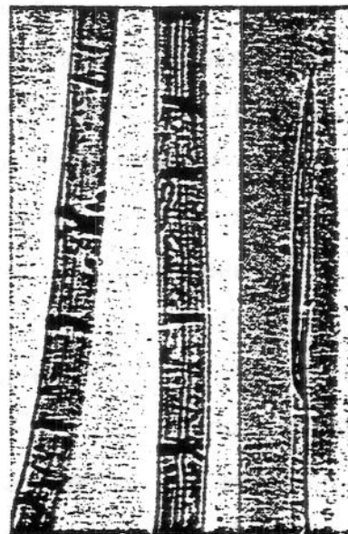
Photomicrograph of flax showing nodes.