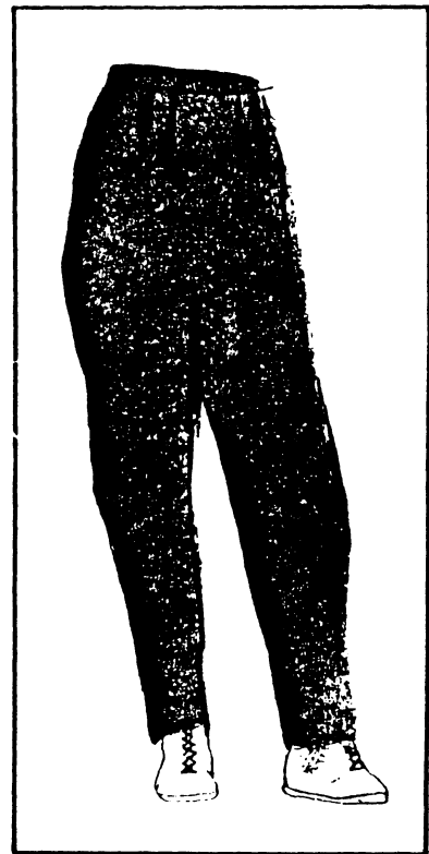
FIGURE 11-32. The side pleats on these pants can disguise a rounded stomach.