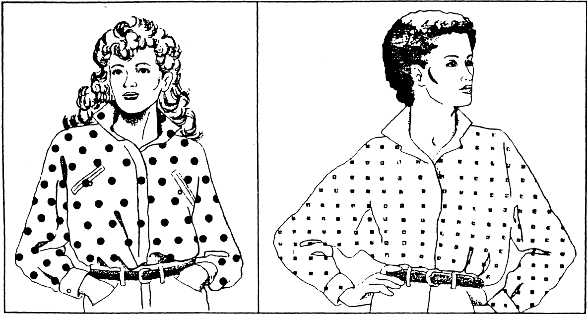
FIGURE 11-22. The figure on the left shows how a patterned fabric with considerable contrast in lightness and darkness enlarges an area. Compare this garment with the one on the right, in which there is less contrast.