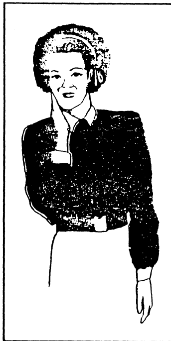
FIGURE 11-31. Soft shoulder gathers can help balance a full bust.