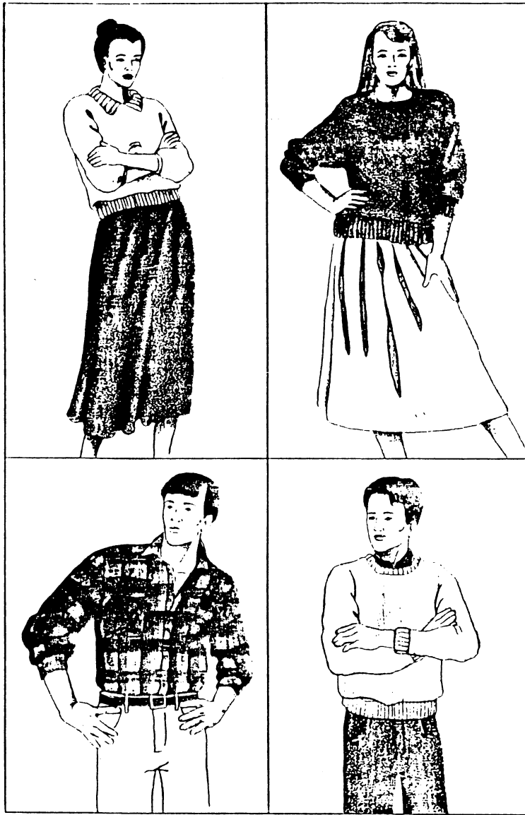
FIGURE 11-20. Color can be used to change proportions. Light or bright colors attract attention, while dark or subdued colors seem to recede