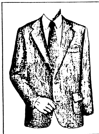
FIGURE 11-19. A dark tie stands out on the light background of a shirt.