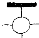
WALL LIGHT (SCONCE, ETC.)