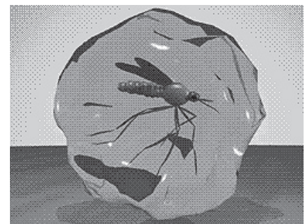
Insect in Amber

mineral : a natural solid material that has a particular crystal structure