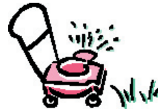
Mechanical Heat Sources