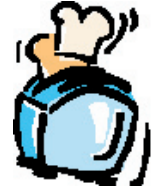
Electrical Heat Sources

Light sources can also be sorted into electrical and mechanical groups. Can you sort a candle, gas lantern, electric light, flashlight, overhead projector, computer screen, glow stick, or fire into these two groups?